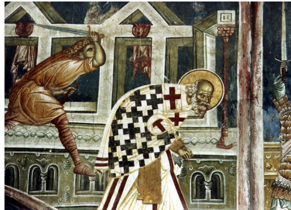
Hieromartyr Pankratios, Bishop of Taormina

Hieromartyr Pankratios, Bishop of Taormina in Sicily; Martyrs Andrew and Probus