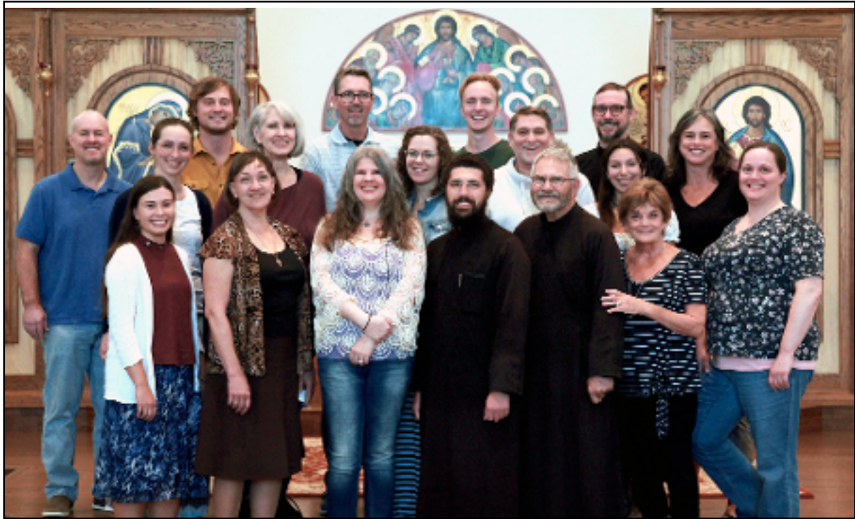
St. Athanasius Choir and Chanters November 2021 Chant Workshop