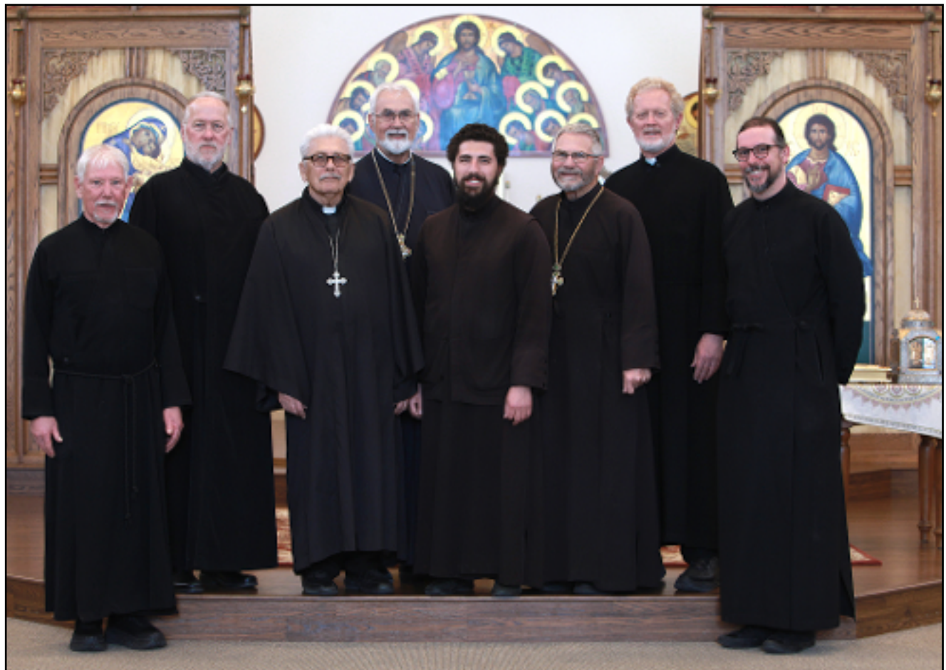
St. Athansius Clergy (from left to right)