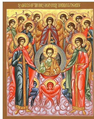
Synaxis of the Archangels — November 8

Venerable Lazarus the wonderworker of Magnesia The Thirty-three Martyrs of Melitene